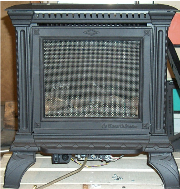
Photo 3 Screen and front installed onto the stove.