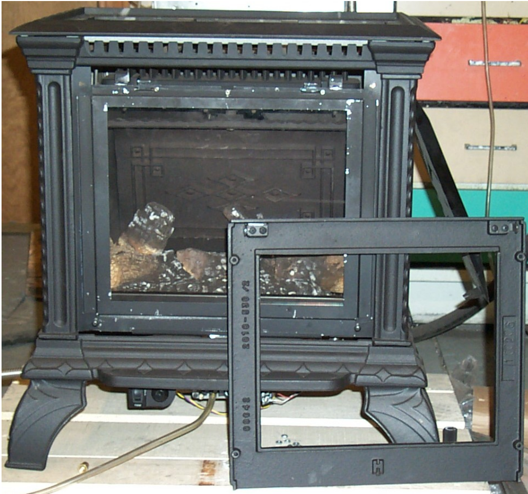
Photo 1 Front removed from stove.