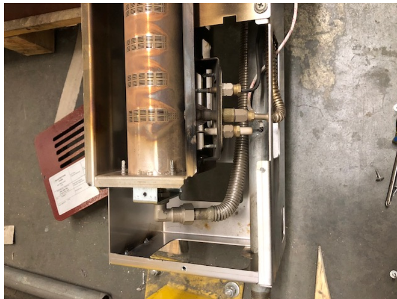
Burner tray shown with cover plate removed.