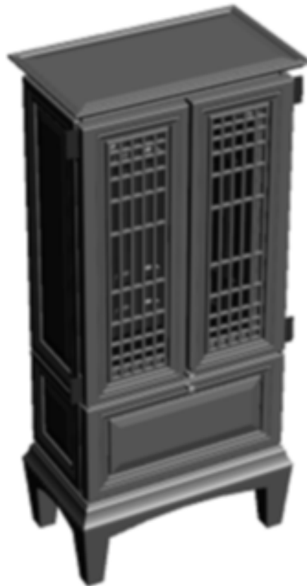
Figure 1 - Tudor 8120 with Grille Panel Set