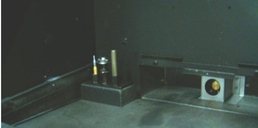
Photo shows Pilot assembly (left) and air shutter with burner orifice (right) in the firebox after the pan burner is removed.

Note: Refer to the owner's manual for the: