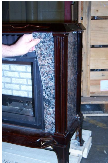
Figure 1 – Inserting the Side and Front Stones